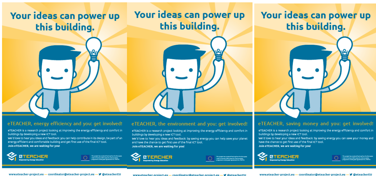
Figure 3 – Posters, English version

The posters have been first produced in English and translated into the other demo sites' local languages, namely Romanian and Spanish (see Annex 1 and 2 respectively). The posters have been provided in e-version and locally printed by the demo sites' leader, who hanged them up in every eTEACHER demo building with the aim both to inform end-users about the project activity in their building and raise awareness and consensus among the users. The e-version of the posters is available also on the project website www.eteacher-project.eu .